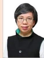
Li-Chiung Su, PhD Deputy Minister Taiwan Ministry of Health and Welfare